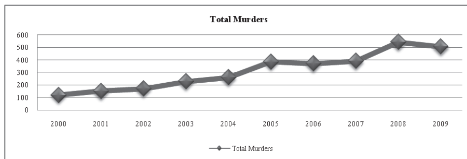
Figure 2 Number of homicides reported to police in Trinidad and Tobago: 2000–2009

The rising violence of the society is further exposed by a review of the other weapons used in homicide and the probable cause of the event. Blunt objects and sharp instruments appear to be the popular choices of weapons, as after firearms they account for 18% of weapons used for 2004–2009 (Table 3). Gang-related and